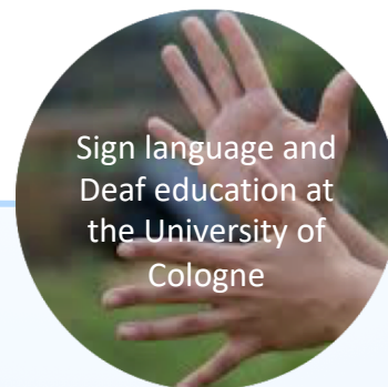
Sign language and Deaf education at the University of Cologne